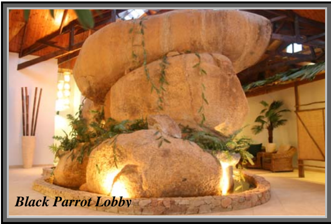
Black Parrot Lobby

Adjacent to the Coco De Mer, our junior suite wing, “the Black Parrot”, is perched on an imposing granite rock out-crop, that offers magnificent views of the surrounding ocean.