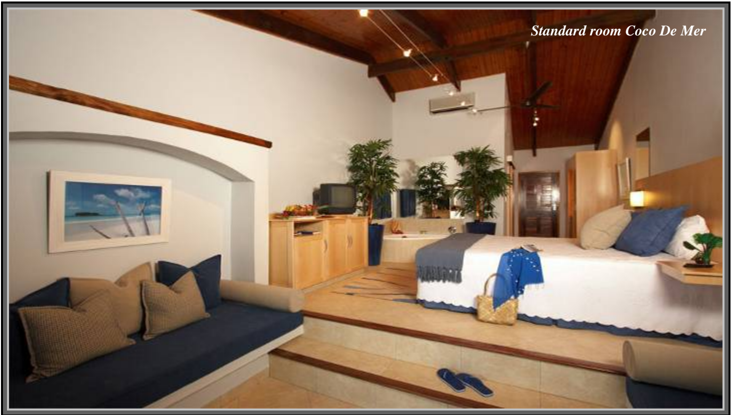
Standard room Coco De Mer