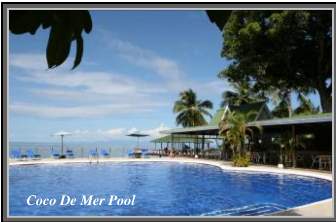
Coco De Mer Pool