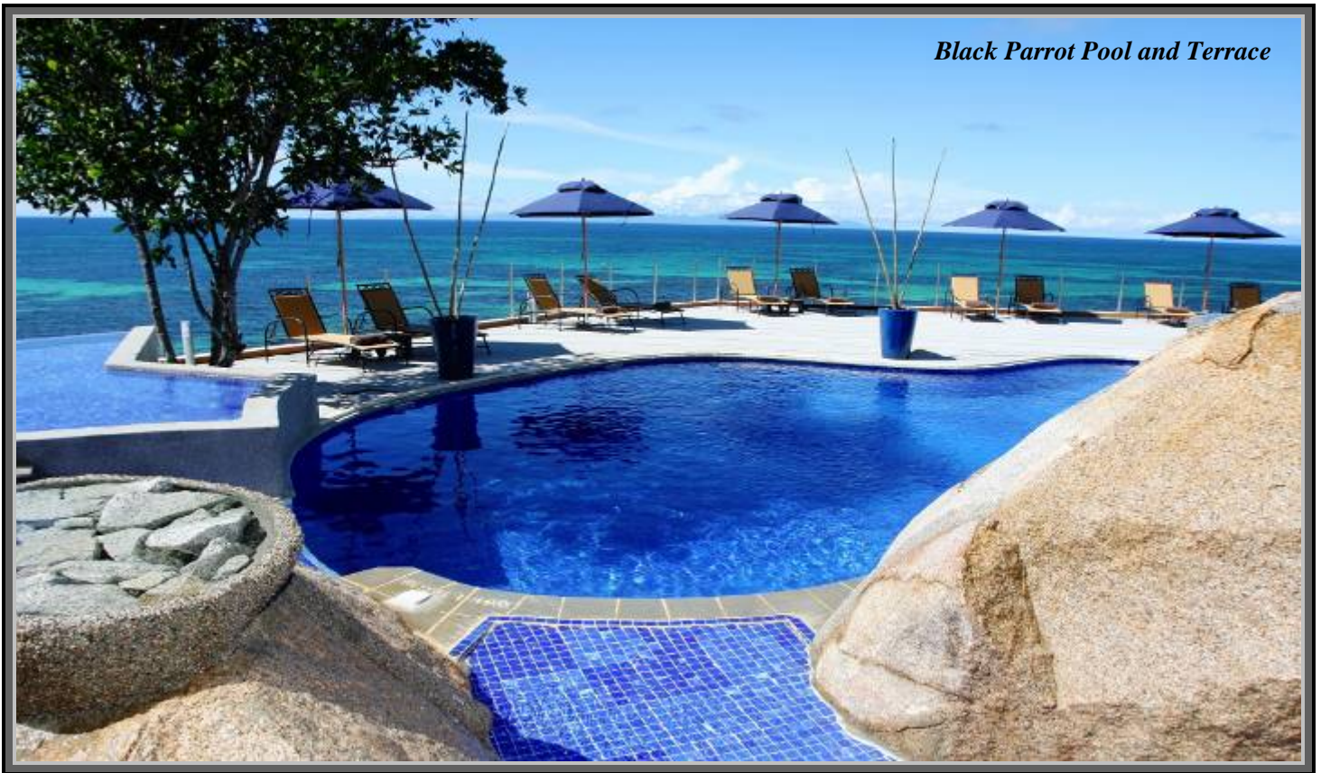
Black Parrot Pool and Terrace