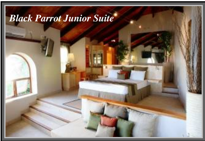
Black Parrot Junior Suite